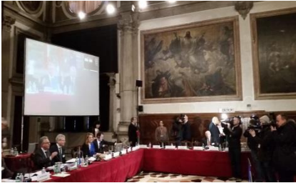
Meeting room of the Venice Commission of the Council of Europe at the March 2016 plenary

Opinion on the constitutional issues addressed in the amendments to the Act of 25 June 2015 on the Constitutional Court of Poland