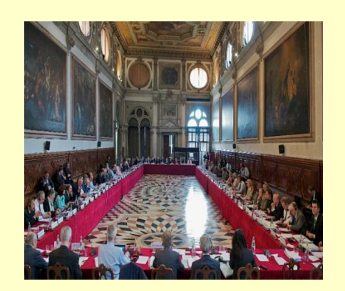
104th Plenary Session of the Venice Commission of the Council of Europe

Link to the calendar of recent and current events