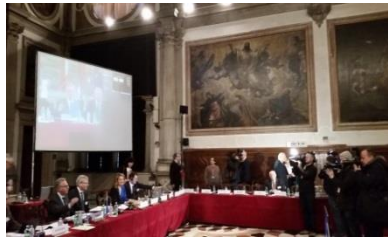
Meeting room of the Venice Commission of the Council of Europe

Opinion on the Amendments to the Federal Constitutional Law on the Constitutional Court of the Russian Federation CDL-AD(2016)016