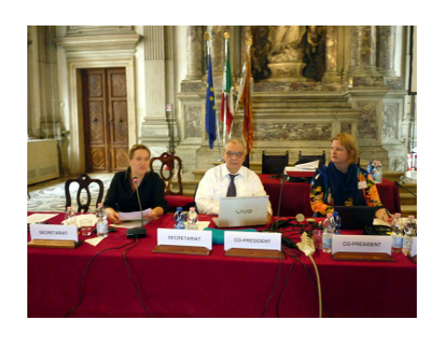
Joint Council meeting, Constitutional Court, Venice, Italy 8 June 2016 Mini Conference