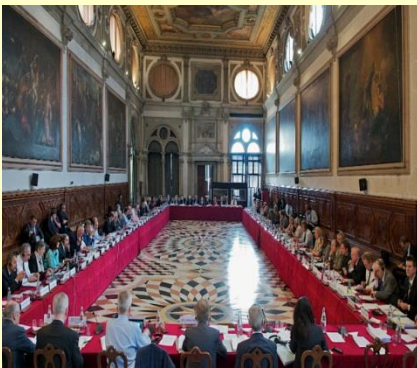
104th Plenary Session of the Venice Commission of the Council of Europe

Link to the calendar of recent and current events