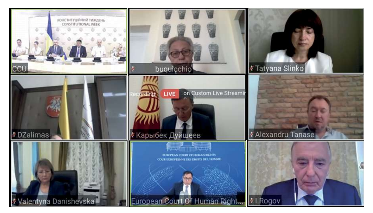
Ukraine - 24th anniversary of the Constitution – international online conference, Kyiv, 25 June 2020