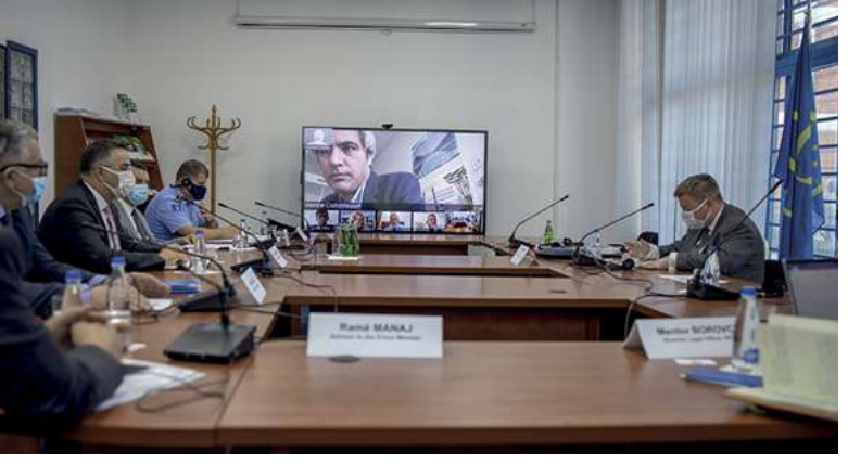
Kosovo – Opinion on the draft law on public gatherings – virtual meetings, 14 - 15 September 2020

the country and to consider either removing draft Art. 177 from the Criminal Procedure Code and placing it into the context of administrative legal provisions or moving the draft provision to the end of the Criminal Procedure Code, clearly indicating its non-coercive but administrative function as well as to consider introducing a right to appeal. Last the Commission suggested introducing provisions regulating the payment of salary during the period of suspension and the rights of the suspended official in the event of an acquittal to be put directly in the draft provision for all public officials in order to ensure a stringent and coherent approach and a harmonised application of the law.