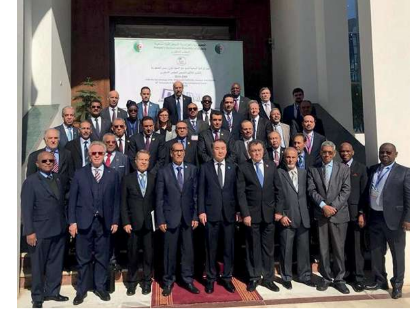
Algeria – Conference on the «Protection of rights and freedoms by the Constitutional Council», 23 - 24 February 2020

The Constitutional Court of Ukraine in cooperation with the Venice Commission and with the support of OSCE Project Co-ordinator in Ukraine, organised an international online conference on the occasion of the 24<sup>th</sup> anniversary of the Constitution of Ukraine and the 30<sup>th</sup> anniversary of the Venice Commission.