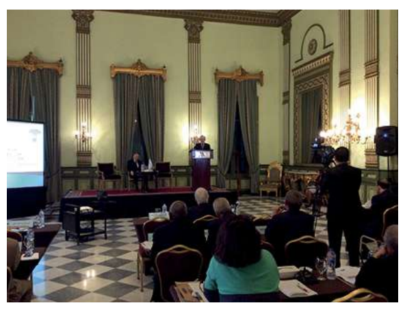
Egypt – international conference by the National Human Rights Council on "Open government", Cairo, 25 - 26 February 2020

In 2020, the Venice Commission provided specific support to the strengthening of the independent bodies of Tunisia (PAII-T project) funded by the Council of Europe and the European Union and implemented by the Council of Europe. This bilateral project (2019-2021) was launched in June 2019. The Venice Commission's expertise was sought with regard to the finalisation of the regulatory framework of all Tunisian independent bodies some of which had been created by the 2014 Constitution. Seminars and workshops organised by the Venice Commission in 2020 were a follow-up to the excellent co-operation launched in 2019 and aimed at supporting the process of institutional development and helping the independent institutions of Tunisia to exercise their powers in an effective, efficient and accountable manner.