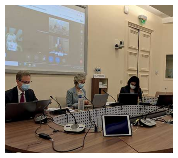
October plenary session of the Venice Commission, Paris/online, 8 October 2020

further 2 online plenary sessions. The Commission thus could adopt formally the opinions, after holding exchanges of views with the authorities and among Commission members.