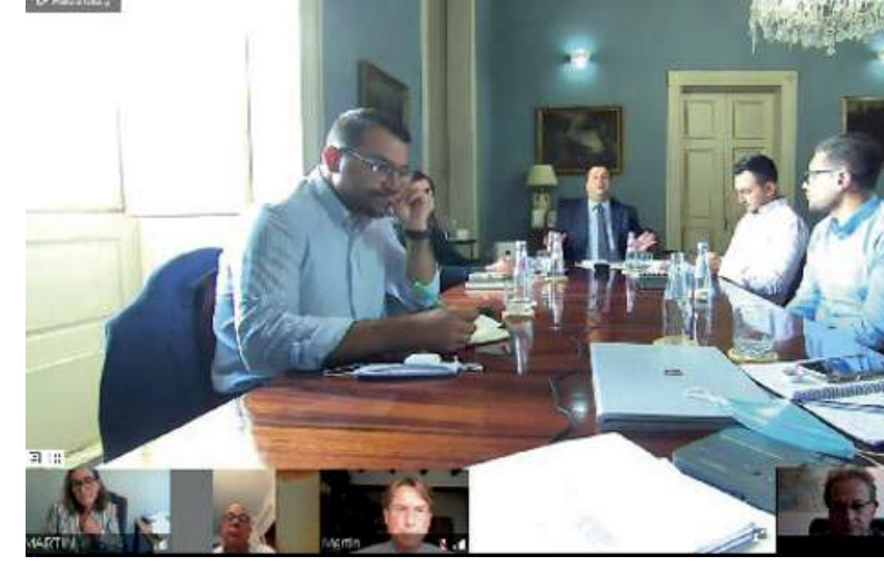
Malta – Opinion on the Bills implementing concepts for reforms - virtual meetings, 1 September 2020

Following an executive order issued by the Prime Minister on 24 September 2020, other legal acts should be harmonised with the provisions of this Code before it officially entered into force on 1 July 2021.