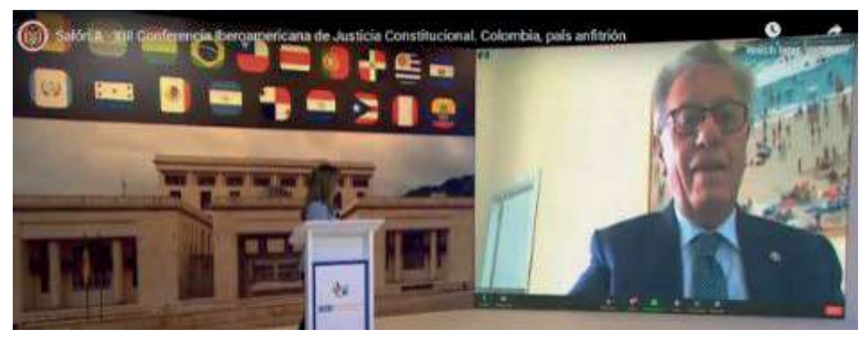
The President of the Venice Commission, Mr Gianni Buquicchio, participating online in the XIIIth Congress of the Ibero-American Conference of Constitutional Justice, Bogota (Colombia), 25 - 26 September 2020