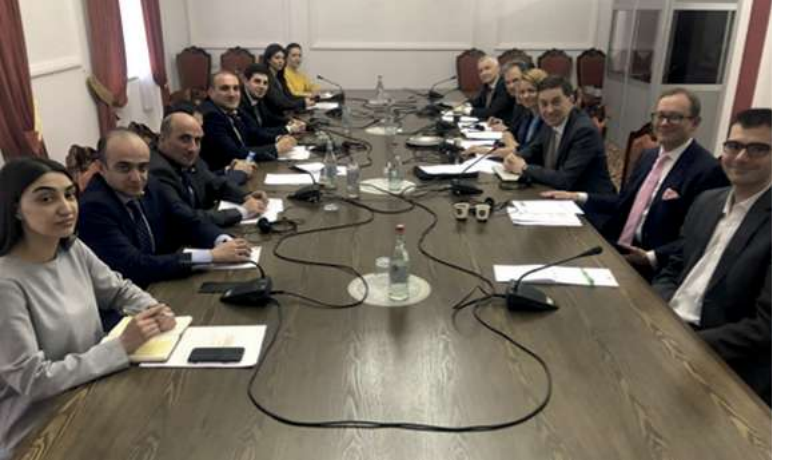
Armenia – Opinion on draft amendments to the legislation concerning political parties – country visit, Yerevan, 2 - 3 March 2020