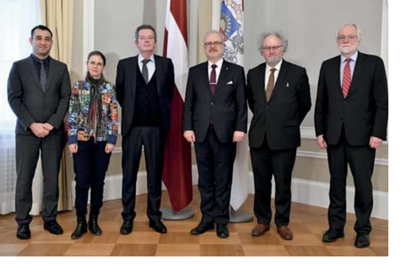
Latvia – Opinion concerning education in minority languages – country visit, Riga, 20-21 February 2020

ability of NCOs to operate and provide public authorities with a wide, literally unchecked discretion in controlling, monitoring and interfering with their activities.