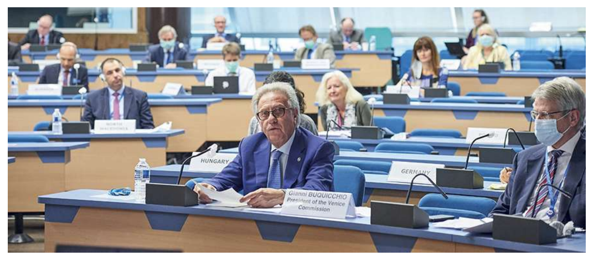
The President of the Venice Commission, Mr Gianni Buquicchio, presenting the annual report of activities of the Commission accomplished in 2019 to the Committee of Ministers of the Council of Europe, Strasbourg, 17 June 2020