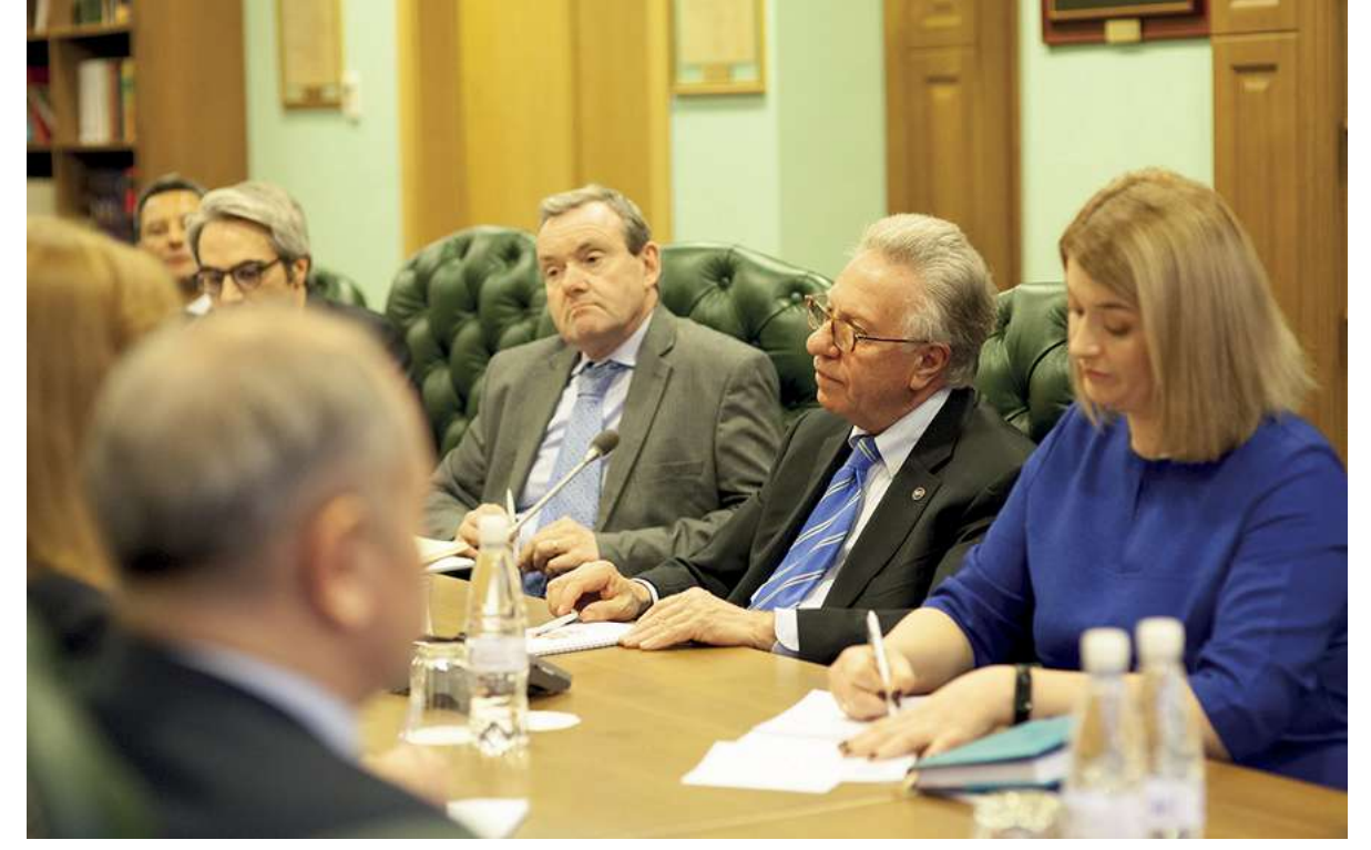
Republic of Moldova – Opinion on the draft law on amending the Constitution – country visit, Chisinau, 19-20 February 2020

president (with a one-time veto), the regulation on functional immunity at the constitutional level; the statement in the constitution that at least half of the members of the Superior Council of Magistracy (SCM) would be judges elected by their peers and that the judge members of the SCM should represent all level courts of law and the consultative role of the SCM in the preparation of the judiciary's budget.