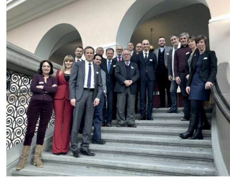
"The legal limits of direct democracy" – International workshop, Zurich, 28 February 2020

Following a complete revision in 2017 which was carried out thanks to financial support from the European Union, the database has been even more modernised and is constantly updated.