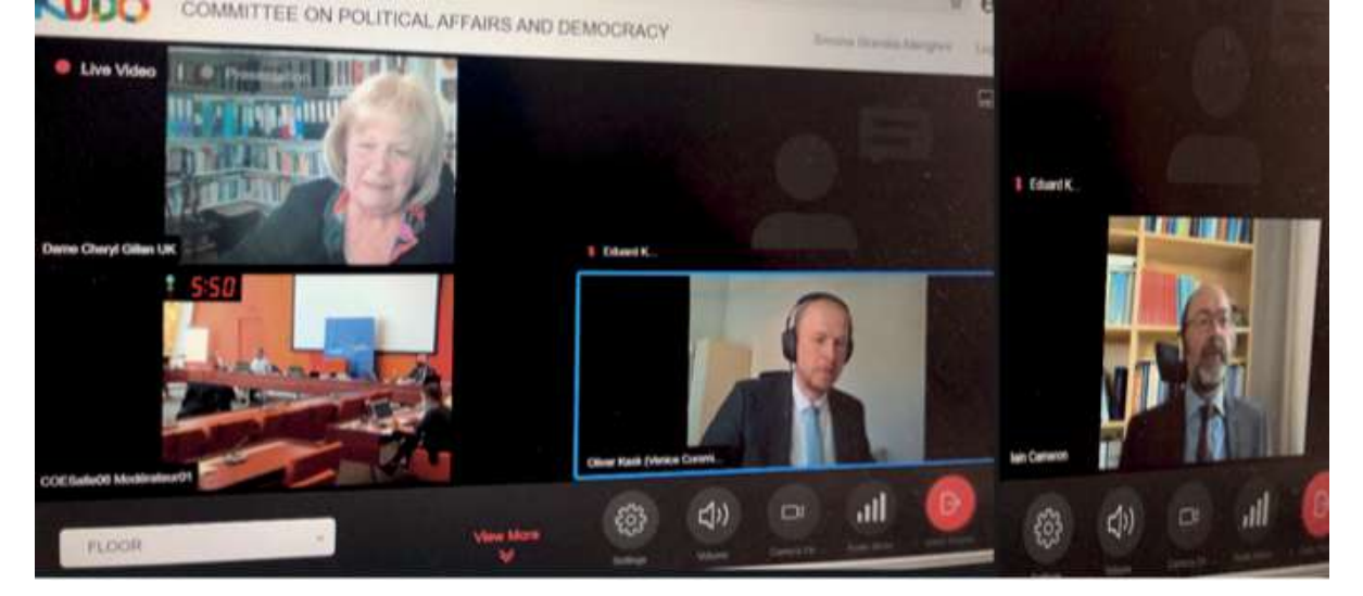
The Venice Commission members participating in an exchange of views with the Committee on Political Affairs and Democracy of the PACE on the role of national parliaments and the holding of elections during emergency situations, 28 May 2020

of health emergencies such as the COVID-19 pandemic. The event was organised by the PACE and the Legal Committee of the Parliament of Georgia.