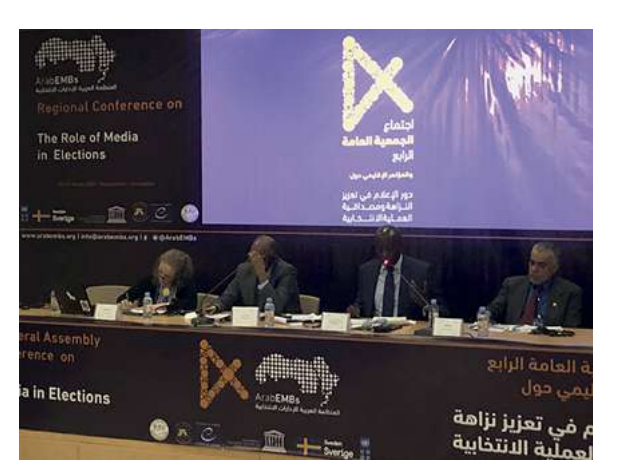
4th General Assembly of the Arab EMBs and international conference "Role of the media in election", Nouakchott (Mauritania), 04 - 06 March 2020

The Venice Commission, the United Nations Development Programme (UNDP) and the Independent High Electoral Commission of Mauritania contributed to the organisation of the 4th General Assembly of Arab Electoral Management Bodies (Arab EMB). The Assembly which took place in Nouakchott, Mauritania from 4 to 6 March 2020 was followed by an international conference on the role of media in elections. The conference gave an opportunity to the Electoral Management Bodies from Arab states to exchange views about the international principles and standards in the field of electoral campaign and to identify the key challenges facing the Arab EMBs and media during the electoral process.