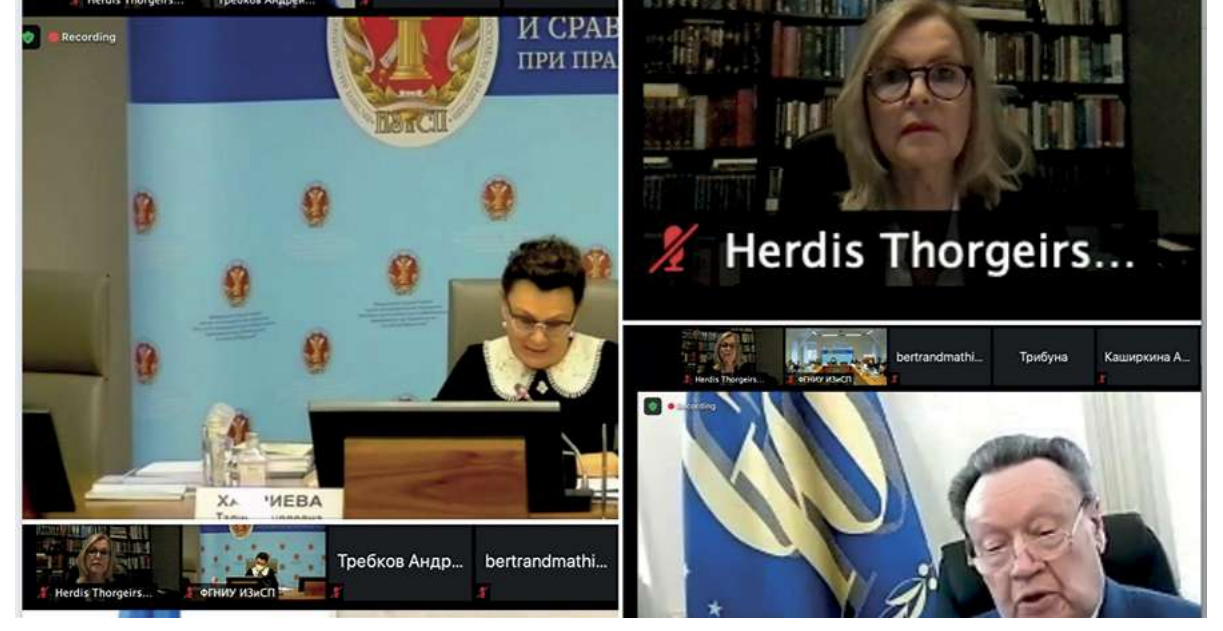
Russian Federation – Xth International Congress of Comparative Law "Constitutional evolution in Russia and in the modern world: dialectics of the universal and national", 4 - 5 December 2020