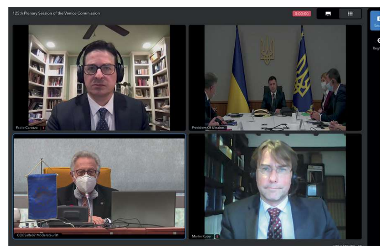
Exchange of views with the President of Ukraine during December 2020 plenary session of the Commission, 11 December 2020.

prepared at the request of the Speaker of the National Assembly, welcomed some of the amendments in this area, which followed its previous recommendations – in particular, the proposed separation of the single judicial council for judges and prosecutors into two separate councils. However, the proposed reform did not address all of the problems of the Bulgarian judiciary, in particular the problem of the lack of the accountability of the Prosecutor General. Finally, the proposed constitutional amendments did not receive support in Parliament and were abandoned.