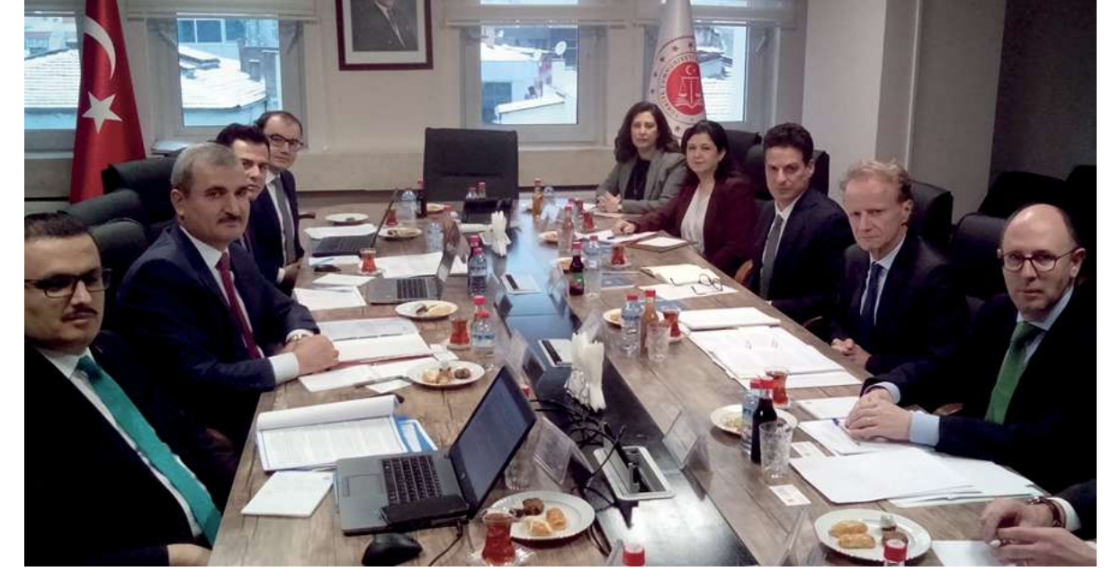
Turkey - Opinion on replacement of elected candidates and mayors - country visit, Ankara, 6-7 February 2020

of the presidential elections held on 28 June and 12 July 2020 in Poland. The delegations observed the opening of polling stations, the voting and counting processes in both rounds.