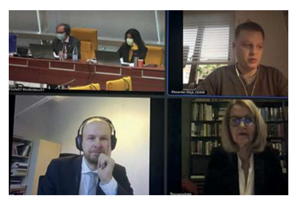
70th meeting of the Council for Democratic Elections, Hybrid: Strasbourg/online, 10 December 2020

The key recommendations of the opinion concerned clarification of the relation between the popular initiative referendum of abrogation of laws or parts of laws and the referendum on "resolving matters of nationwide significance"; increasing the role of the Parliament before the vote, as well as, if necessary, after the vote and in conformity with the results; ensuring equal opportunities for the supporters and the opponents of issues submitted to referendum in referendum commissions of different levels; extension of the deadline for collecting the signatures for referendums on popular initiative and synchronising the provisions of the Draft law on funding of referendum campaign with the legislation on financing of political parties. The opinion also recommended to exclude from the draft law provisions on electronic voting and regulate these issues globally at a later date by way of a separate law, which would also address local, parliamentary and presidential elections.