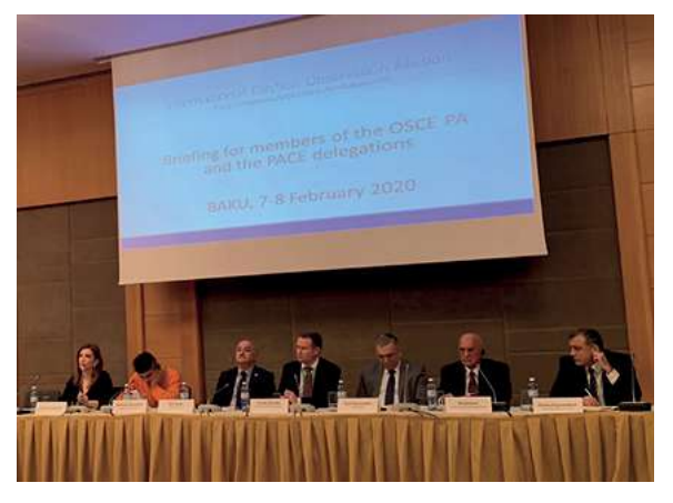
Azerbaijan - Briefing for OSCE and PACE observers of early parliamentary elections, Baku, 9 February 2020