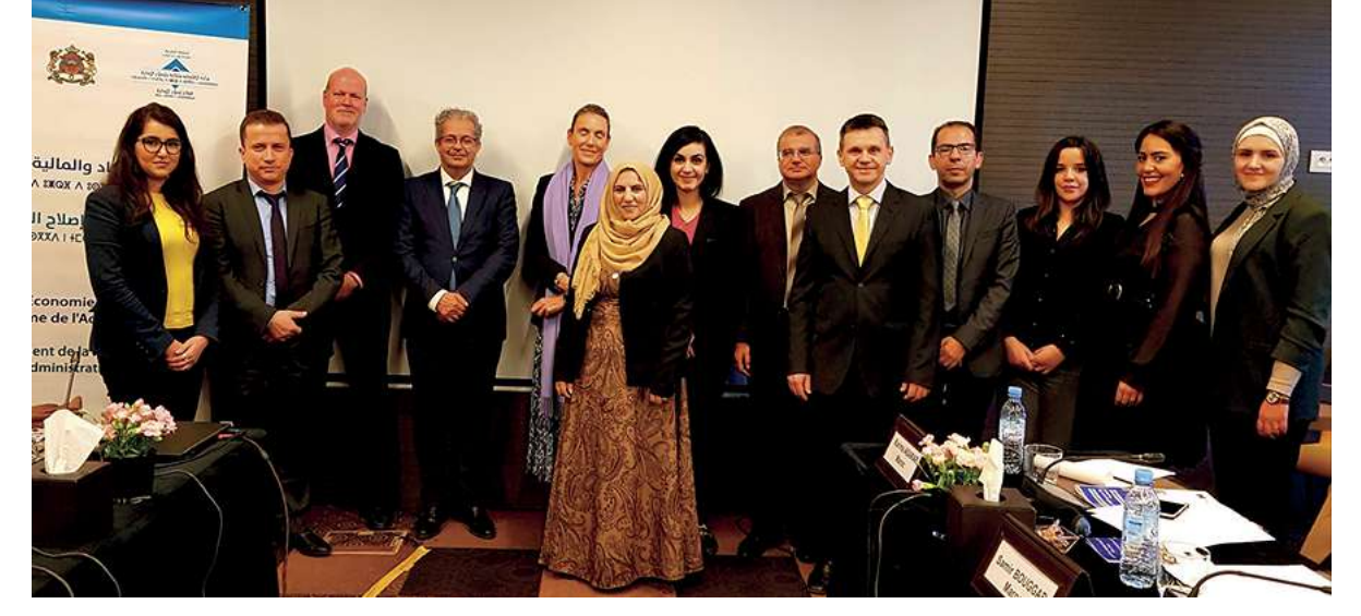
5th coordination meeting of the UniDem project for the southern Mediterranean, Rabat, 6 February 2020

improvement of the electoral legal framework based on recommendations of international observation missions (16 July 2020), and to discuss the role of the ISIE in monitoring the written press and social media during election campaigns (13 November 2020).