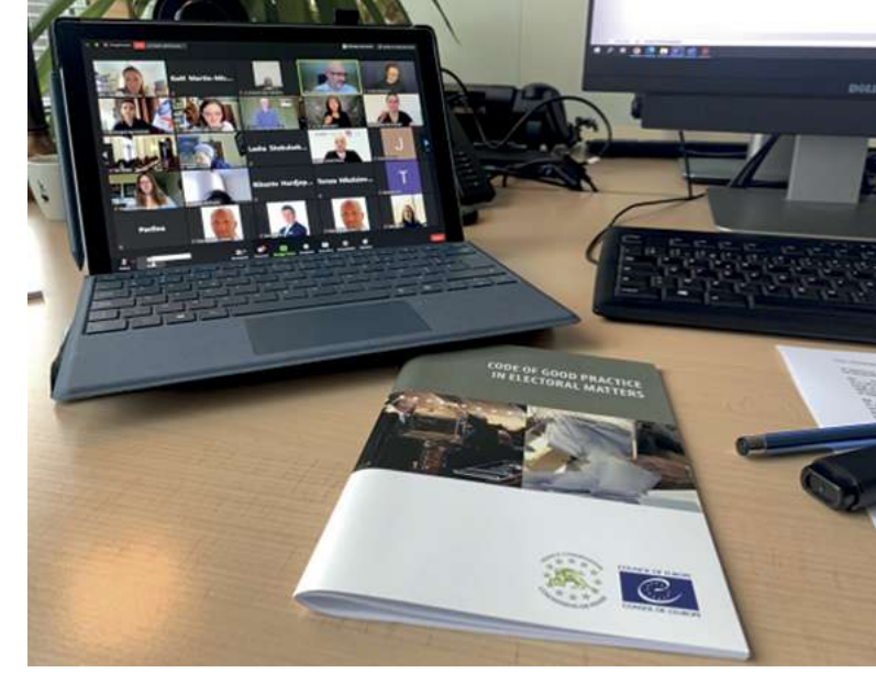
IFES Webinar Series: Administering Elections in Europe During a Pandemic - Webinar 4: "Inclusion of persons with disabilities in the electoral process", 24 September 2020

The conference was an online public event; approximately 160 participants followed the debates. The conference was organised in the framework of the