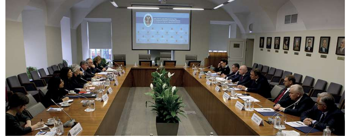
Russian Federation – Opinion on draft Amendments to the Constitution of the Russian Federation (as proposed by the President of the Russian Federation on 15 January 2020) relating to the execution of decisions by international bodies – country visit, Moscow, 02 - 03 March 2020