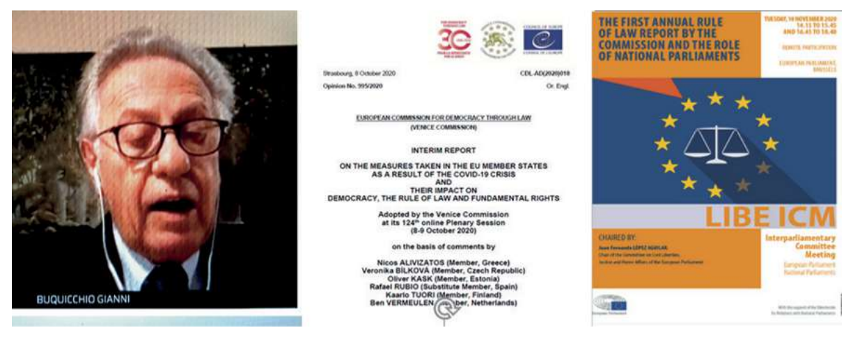
European Parliament - online Interparliamentary Committee Meeting on the "First Annual Rule of Law Report by the Commission and the role of national Parliaments", 10 November 2020

Commission's Interim Report on the measures taken in the European Union member states as a result of the COVID-19 crisis and their impact on democracy, the rule of law and fundamental rights, adopted by the Commission at its October 2020 plenary session.