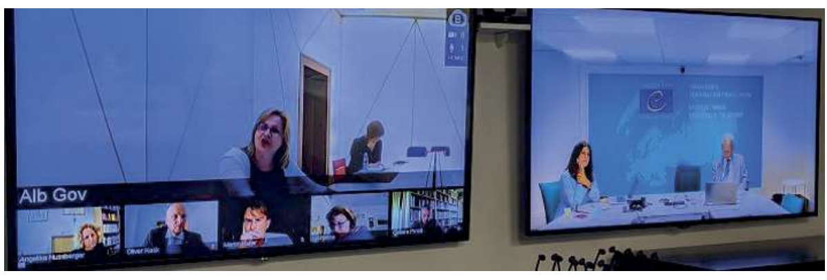
Albania – Opinions on the draft amendments to law N^{\circ} 97/2013 on the Audiovisual Media Service and on the appointment of members of the Constitutional Court – virtual meetings, 11 - 12 June 2020

AMA) and of the Complaints Committee (the CC) to the sector of online media and give this authority new administrative powers in this field.