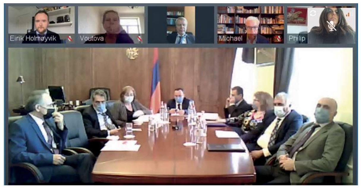
Armenia – Opinion on three legal questions in the context of the draft constitutional amendments concerning the mandate of the judges of the Constitutional Court - virtual meetings, 25 - 27 May 2020

judges appointed before the entry into force of the amendments, but having served less than 12 years, would stay in office until they have served for a total of 12 years.