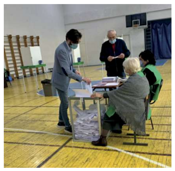
Georgia – parliamentary election – legal assistance to the PACE election observation mission, Tbilisi, 29/10 - 01 November 2020

which was limited however by three mechanisms: the 5% threshold for legislative elections, the prohibition of party blocs and the distribution of unallocated mandates to the winning party (the so-called bonus system). However, in a very controversial move, the entry into force of the proportional election system was postponed to October 2024.